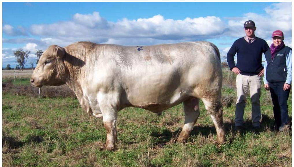
Top priced bull Lot 2 C36 Wallawong Riddler pictured with selling agent Tim Walsh (representing purchaser Craig Grant) and Kate James

Two bulls made $4250, Lot 10 Wallawong Rumble at 840kg EMA 121cm 2 and Lot 17 Wallawong Romantic 750kg EMA 114cm 2 . Both bulls were sired by the breed's leading eye muscle sire Lindsay Starbright S117 that we purchased in 2005.