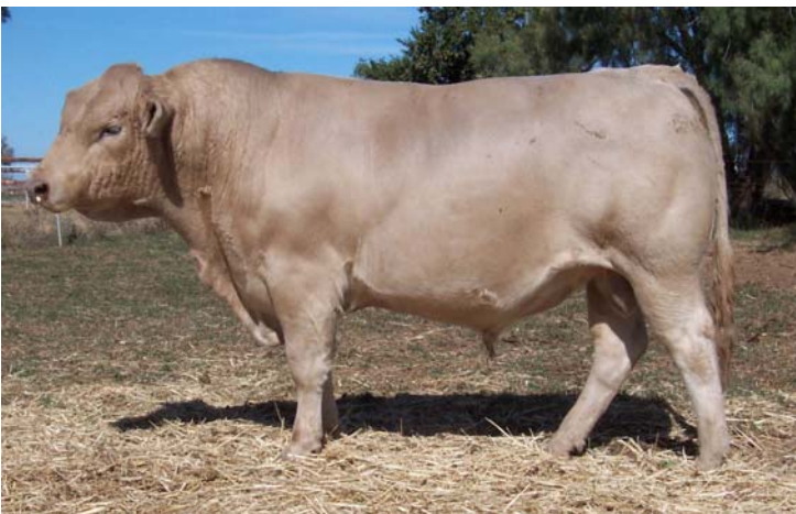
2nd top price bull Lot 6 C8 Wallawong Rainman