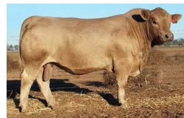
Sire - Wallawong Match Fixer M66