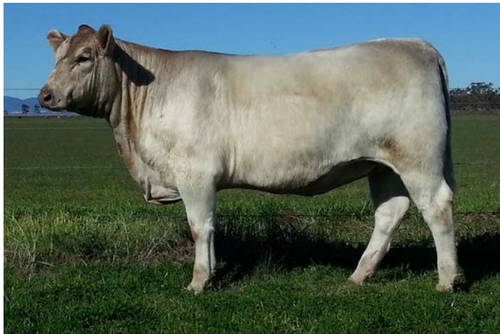
Bundaleer Lolita JOS H17