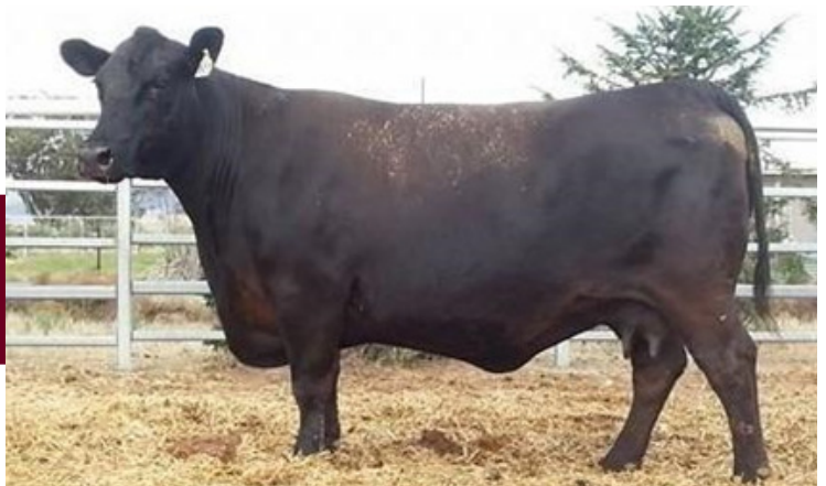
Woodbourn Queen F24 Angus Female at Wallawong