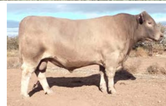
Sire - Wallawong Magic Man M47