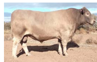
Sire - Wallawong Magic Man M47