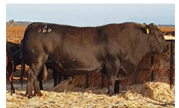
Sire - Burenda Legible L446