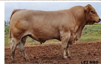
Sire - Wallawong New Kid On The Block