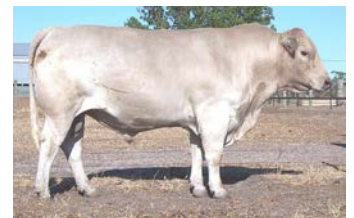
Sire - Lindsay Starbright Y74