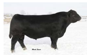
Sire - Sitz Upward 307R