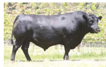
Sire - Cherlyton Stewie D19

Comments: Rocket is a super functional 16 month old sire that is a heifer's first calf. With plenty of easy calving genetics present he is recommended for heifer matings. A functional sire that will continue to grow and develop into a classy bull. Being well above average for Growth, Scrotal Size and IMF EBVs add to his MSA and fertility credentials.