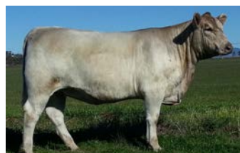
Dam - Bundaleer Lolita H17

Comments: Quality is a highly desirable bull, with the thickness, muscularity and coat type that deserves attention. With outstanding muscularity, he leads the way in carcase yield but maintains mobility and industry relevant softness. He bends the EBV curve being below breed average for Birthweight and above for all growth traits and EMA. A bull that is sure to stamp his mark on his outstanding progeny.