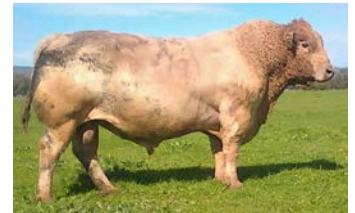
Sire - Wallawong Ripsnorter C46