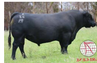
Sire - Pathfinder Complete K22