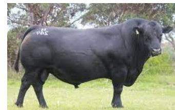
Sire - Coonamble Hector H249