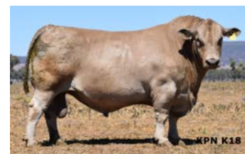
Sire - Bottlesford Kudos

Comments: A super powerful outcross black herd bull from grey parentage. A sire with added hindquarter shape and full, deep topline. A bull that will add some extra dimension, depth and carcase yield to his progeny. He will produce black calves when mated to black Angus females.