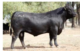
Sire - Granite Ridge Kaiser K26