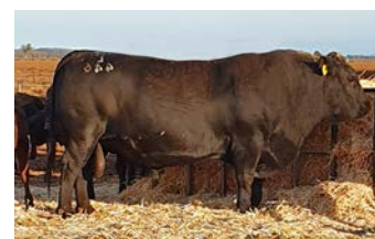
Sire - Burenda Legible L446