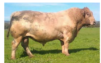
Sire - Wallawong Ripsnorter C46