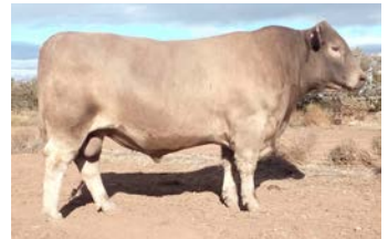
Sire - Wallawong Magic Man M47