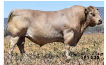
Sire - Wallawong Vinnie Roe