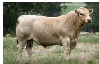
Sire - Lindsay Empire E46