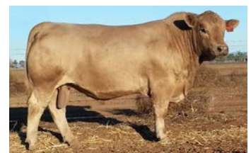
Sire - Wallawong Match Fixer M66