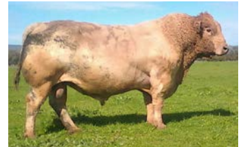
Sire - Wallawong Ripsnorter C46