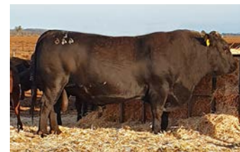
Sire - Burenda Legible L446