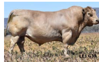
Sire - Wallawong Vinnie Roe