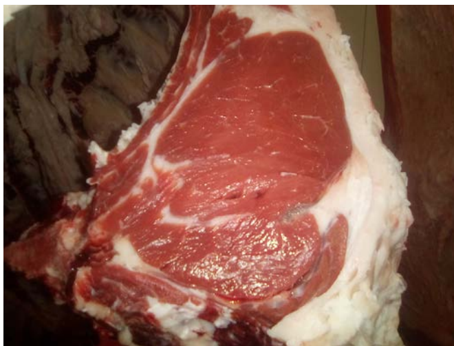
2019 Wingham Beef Week - Led Lightweight Champion