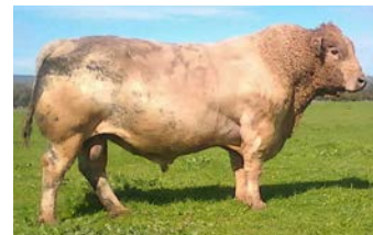
Sire - Wallawong Ripsnorter C46