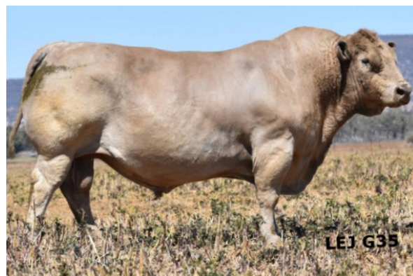
Sire - Wallawong Vinnie Roe

Tullibardine Jeopardy J14 D: Wallawong Gretel N17 Wallawong Gretel K22