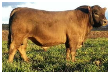
Maternal 1/2 Brother - Wallawong Wall St

Comments: Qantas is sure to take your breeding program to new heights. He is a very docile bull with a quality packed pedigree. His dam was a prolific bull producer, having produced stud sires and highly relevant industry sires. An excellent bull for producing profitable heavy domestic offspring with added muscle as indicated by his EMA EBV being in the top 5%.