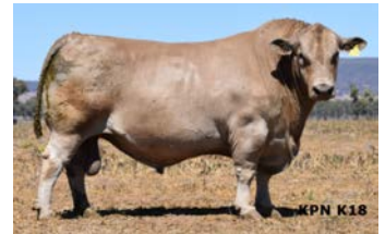
Sire - Bottlesford Kudos