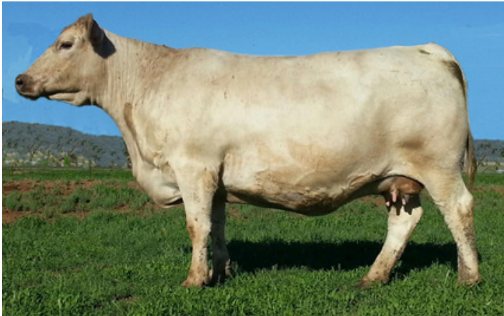
Bundaleer T.T. B33