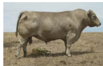
Sire - Wallawong Riddler