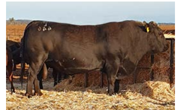
Sire - Burenda Legible L446