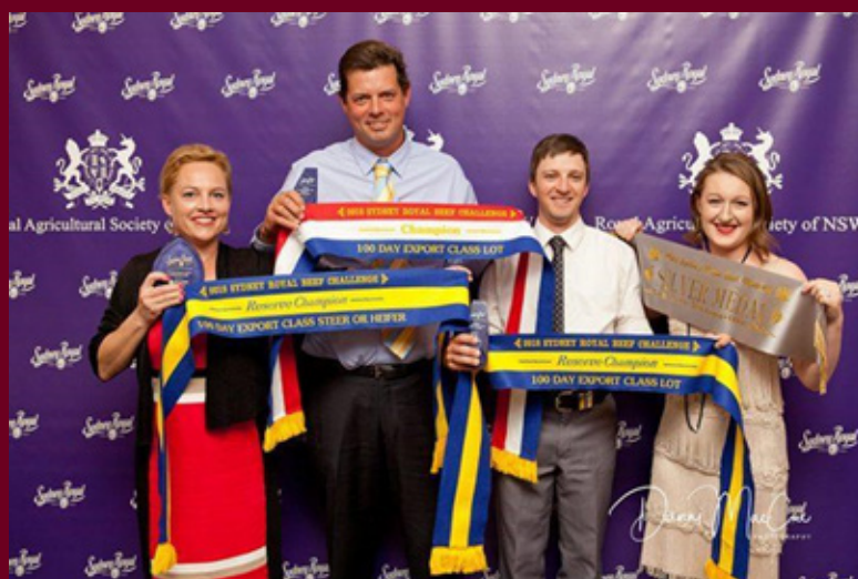
2018 RAS Beef Challenge

Champion and Reserve Champion Pen of 6 - 100 Day Fed Wallawong Black Angus steers