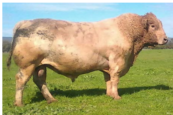
Sire - Wallawong Ripsnorter C46

Comments: Jennifer is another functional heifer from the last natural mating or Ripsnorter. Well worthy of selection and from a broody, functional female. EBVs to be updated prior to sale. To be AI'd to Ayr Park Quincey prior to sale.