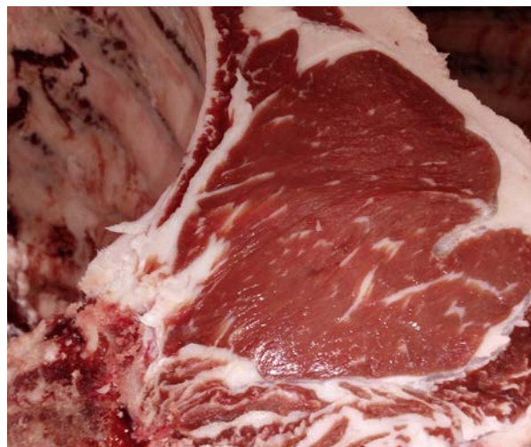
2018 Wingham Beef Week - Wallawong & Birchall Winning Carcase