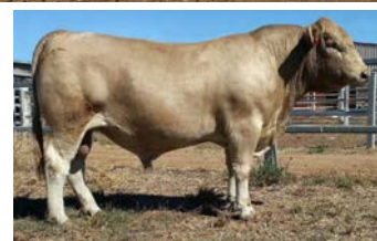
Sire - Wallawong Masterclass M22