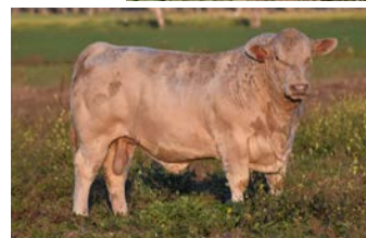
Maternal 1/2 Brother to Q8

Comments: Quicksilver displays a moderate frame with a solid hindquarter and sire's outlook. His sire was the $18k 2018 sale topper, while his dam produced last year's $12k high priced bull. A very good genetic package, with desirable EBVs, suited to producing progeny for the heavy domestic MSA market.